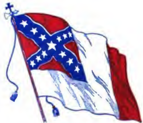
THE NATIONAL FLAG.

Adopted by the Congress of the Confederate States of America, May 1, 1863.